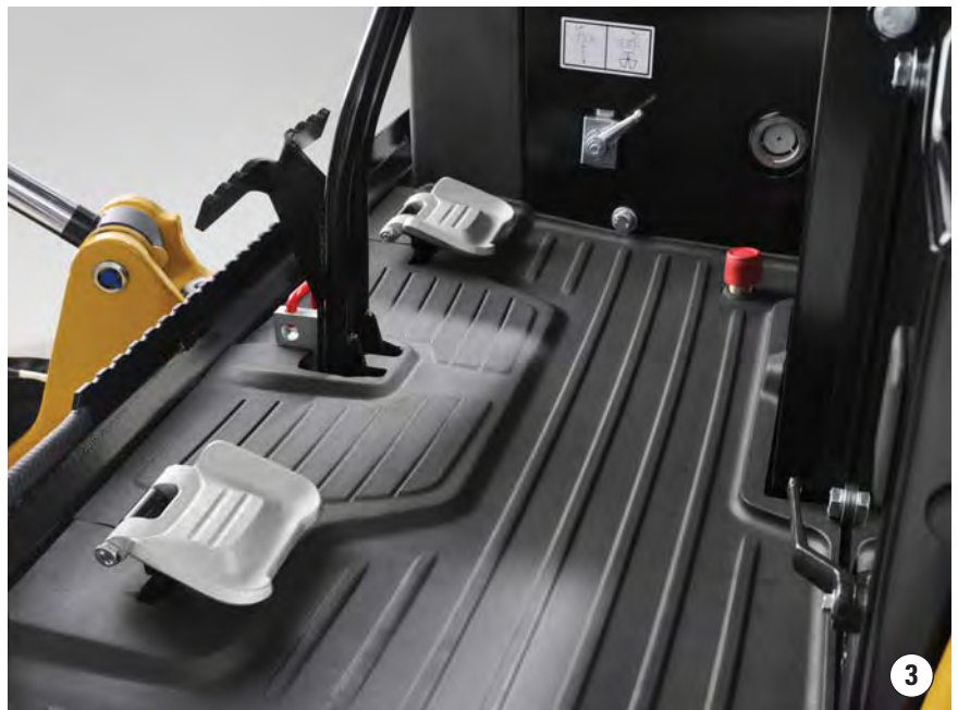
1) Roof guard and lights 2) Instrumentation 3) Travel pedals

Travel foot bars are provided as standard to make moving around site easy and effortless. Ideal for traveling over longer distances or when you wish to operate the front linkage at the same time.